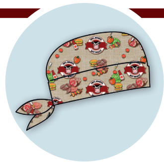
Art. 5035866 BANDANA

poly 100% - 150gr/mq Meat fantasia Meat fantasia Bandana