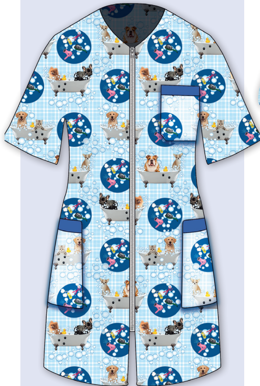
Art. 4244865 CASACCA TANIA

manica corta poly 100% - 150 gr/mq Love Pets fantasia Vest Tania short sleeve - Love Pets fantasia XS/S/M/L/XL/XXL