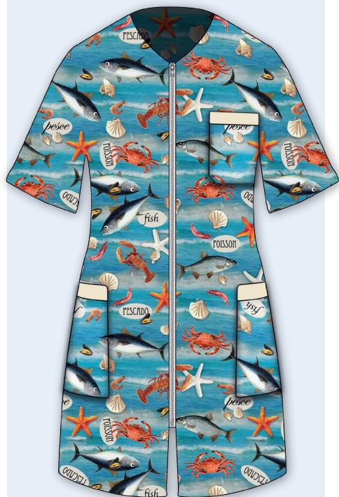
Art. 4244867 CASACCA TANIA

manica corta poly 100% - 150 gr/mq Fish fantasia