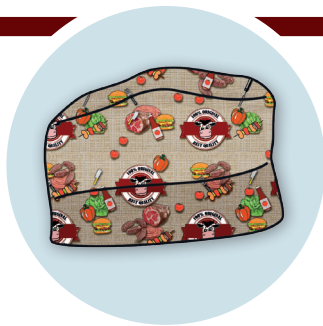
Art. 5006866 BUSTINA C/VELCRO

poly 100% - 150gr/mq Meat fantasia Meat fantasia Bandana