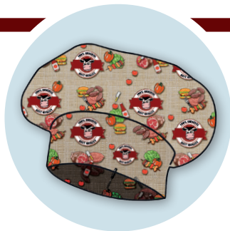
Art. 5001866 CAPPELLO CUOCO

regolabile c/velcro pol/cot - 150gr/mq - Meat fantasia Cap adjustable with velcro Meat fantasia - Taglia unica