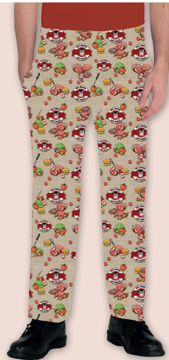
Art. 1595866 PANTALONE

c/elastico e coulisse, 1 tasca dietro e 2 davanti poly 100% - 150 gr/mq - Meat fantasia Trousers Urban Royal with elastic band and coulisse, 1 patch pocket and 2 front pockets Meat fantasy S/M/L/XL/XXL - Unisex