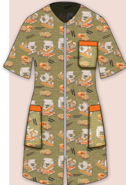
Art. 4244866 CASACCA TANIA

manica corta poly 100% - 150 gr/mq Bakery fantasia Vest Tania short sleeve - Bakery fantasia XS/S/M/L/XL/XXL