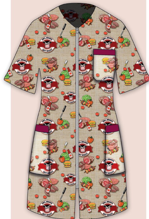
Art. 4244866 CASACCA TANIA

manica corta poly 100% - 150 gr/mq Meat fantasia