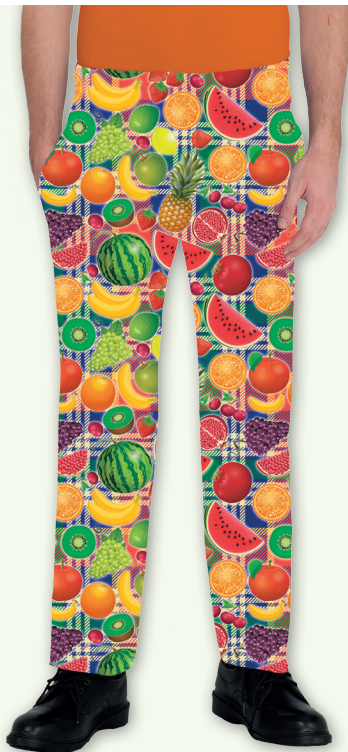
Art. 1595858 PANTALONE

c/elastico e coulisse, 1 tasca dietro e 2 davanti poly 100% - 150 gr/mq - Fruit fantasia Trousers Urban Royal with elastic band and coulisse, 1 patch pocket and 2 front pockets Fruit fantasy S/M/L/XL/XXL - Unisex