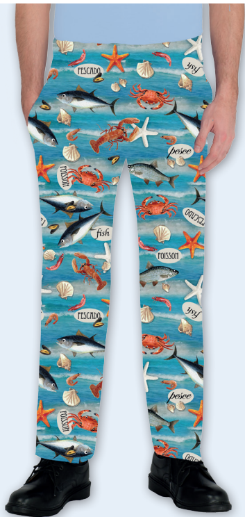
Art. 1595867 PANTALONE

c/elastico e coulisse, 1 tasca dietro e 2 davanti poly 100% - 150 gr/mq - Fish fantasia Trousers Urban Royal with elastic band and coulisse, 1 patch pocket and 2 front pockets Fish fantasy S/M/L/XL/XXL - Unisex