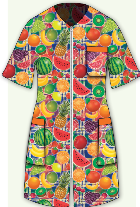
Art. 4244858 CASACCA TANIA

manica corta poly 100% - 150 gr/mq Fruit fantasia