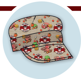
Art. 5032866 BERRETTO CON VISIERA

poly 100% - 150gr/mq - Meat fantasia Fabric cap with velcro - Meat fantasia Taglia Unica - Unisex